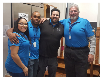
Legacy Power employees spent a morning helping clients in our Food Pantry