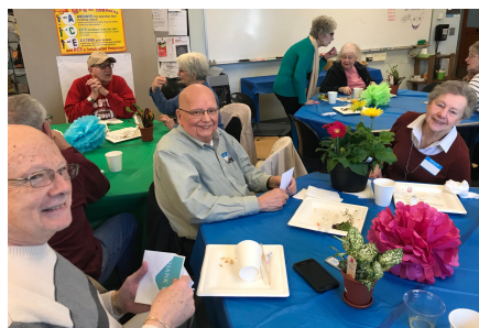
Honoring our dedicated volunteers at the annual Volunteer Appreciation Brunch