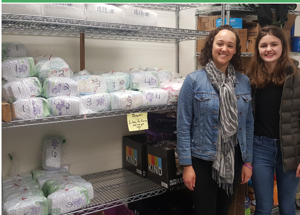
Lafayette College student volunteers held a diaper drive for our Food Pantry clients